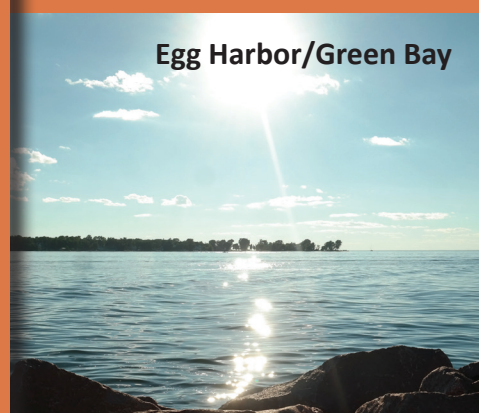
Egg Harbor/Green Bay