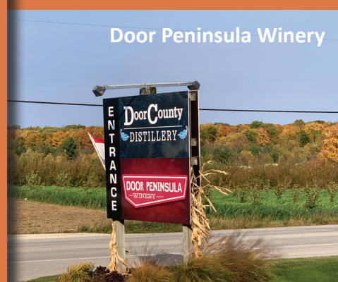
Door Peninsula Winery