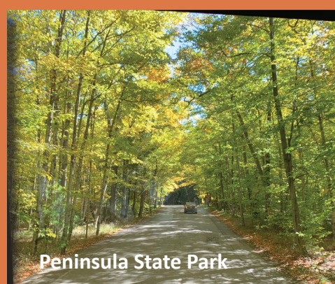
Peninsula State Park