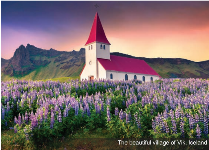
The beautiful village of Vik, Iceland