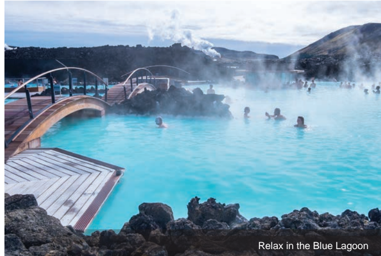
Relax in the Blue Lagoon

DAY 1 – Oct 18 Depart the USA: Today you'll depart the USA on your overnight flight to Keflavik, Iceland.