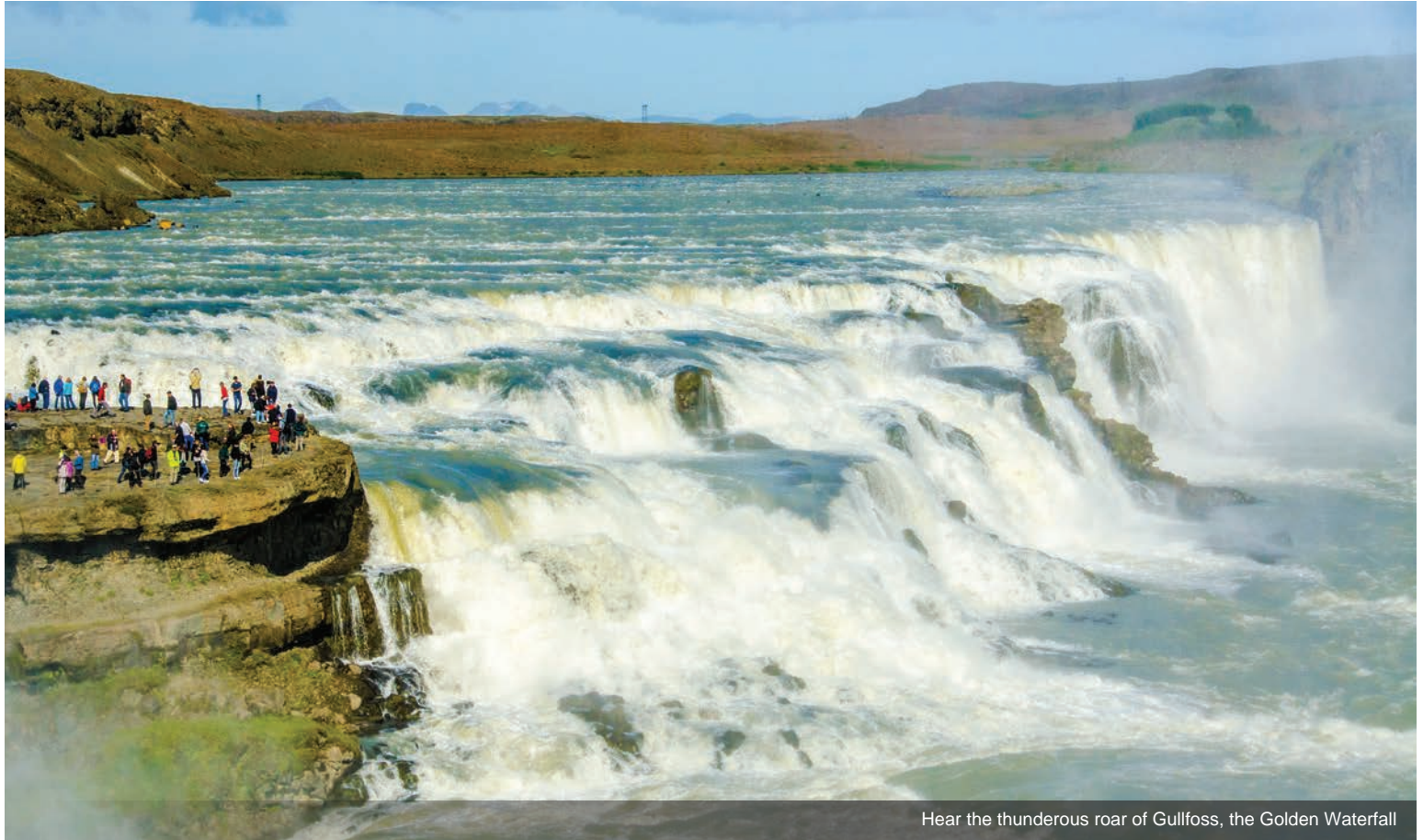
Hear the thunderous roar of Gullfoss, the Golden Waterfall